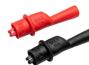
Crocodile clip mini, 1 kV 10 A (set)