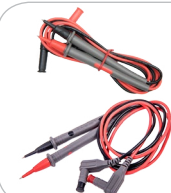
Set of test leads